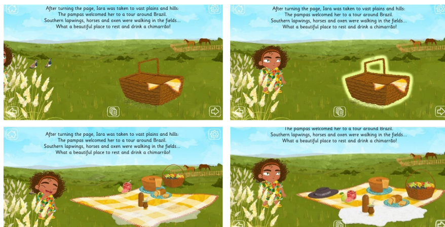
Figure 1 – Episode 2

The static image shows a landscape inspired by the pampas’ habitat, with a picnic basket in the foreground, and southern lapwings and horses represented in the background. The moving image introduces the protagonist. The reader’s touch on the picnic basket activates an animation and reveals the picnic, as captured in the sequences of screen shots in Figure 1.